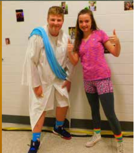
Homecoming fun