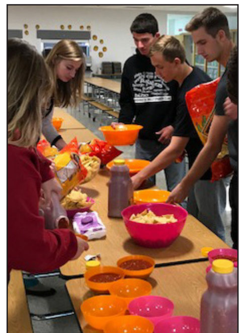
The Spanish IV class provided chips and salsa at lunch on Wednesday as part of Hispanic Heritage month.