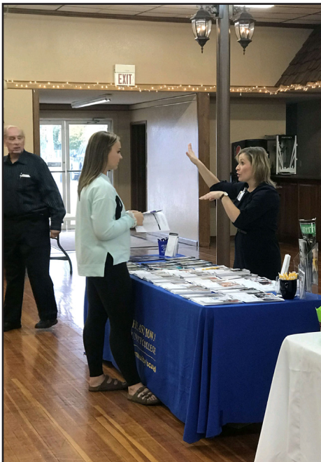
The juniors took a field trip to Manchester Thursday afternoon. They visited with different business and industry leaders in the area. The event was sponsored by Delaware County Economic Development.