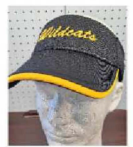
$14 AUGUSTA VISOR