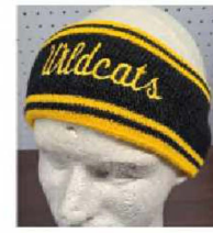
$17 WINTER HEADBAND