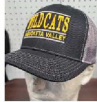
$20 TRUCKER HAT