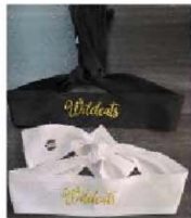
$17 HOLLOWAY SPORTS HEADBANDS