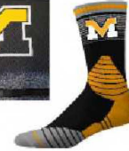
$15 SUBLIMATED SOCKS ADULT & YOUTH SMALL MEN'S 1-8 WOMENTS 3-10 STANDARD MEN'S 8-13 WOMEN'S 6-11 X-LARGE MEN'S 10-15