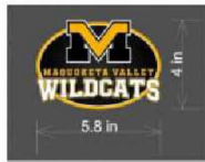
$8 CAR DECAL