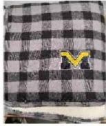
$43 SHERPA LINED BLANKET