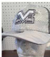
$23 NEW ERA FLEXFIT HAT