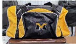
$40 DUFFLE BAG