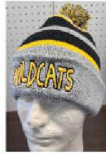
$23 STRIPED STOCKING HAT