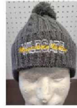
$17 CABLE KNIT STOCKING HAT