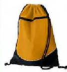
$15 AUGUSTA CINCH SACK