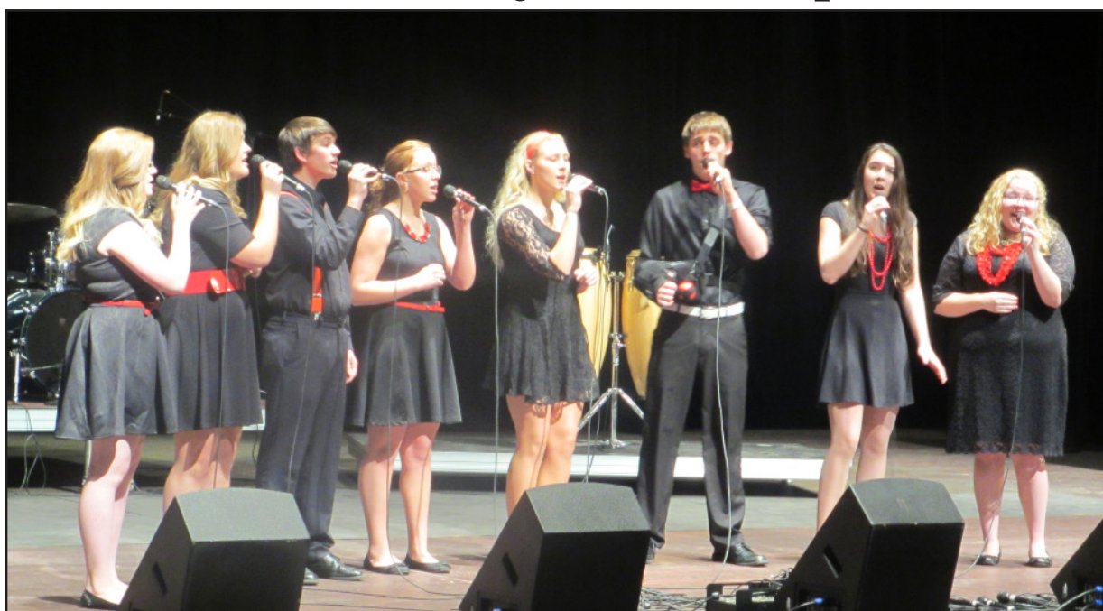
Members of Smooth Harmony perform at the Kirkwood Jazz Festival last Friday.